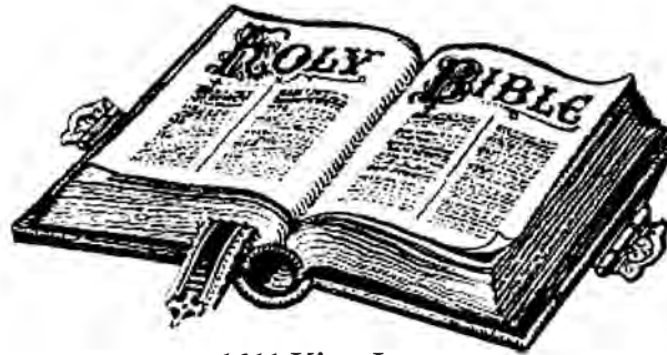
1611 King James

In Session Assembled with the Pleasant View Church August 1, 2, 3, 2014